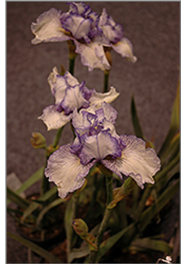
Autumn Circus Iris flowers