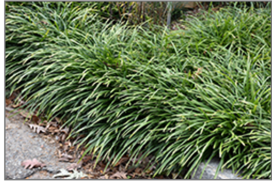
Big Blue Lily Turf