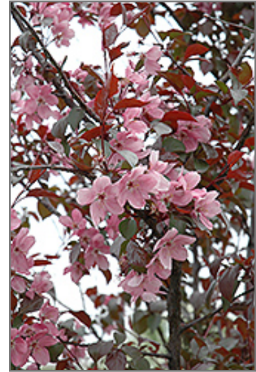
Perfect Purple Crabapple flowers