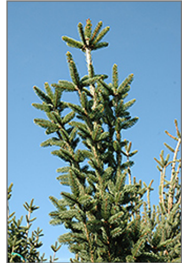
Columnar Norway Spruce foliage