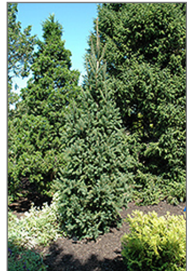
Columnar Norway Spruce