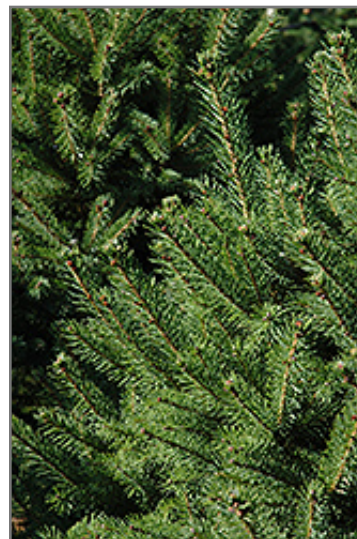
North Star Spruce foliage