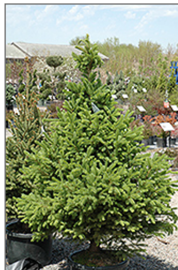
North Star Spruce