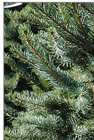
Serbian Brun's Spruce foliage