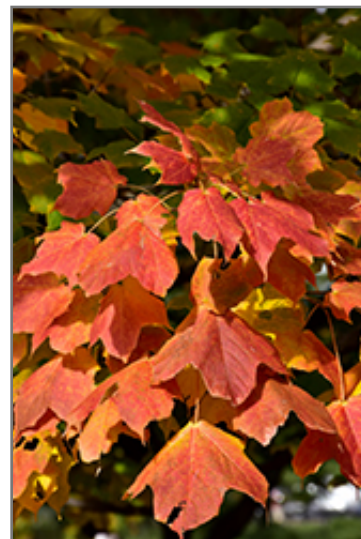
Green Column Sugar Maple in fall