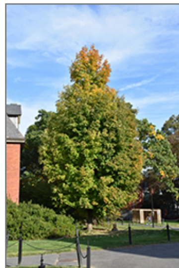
Green Column Sugar Maple