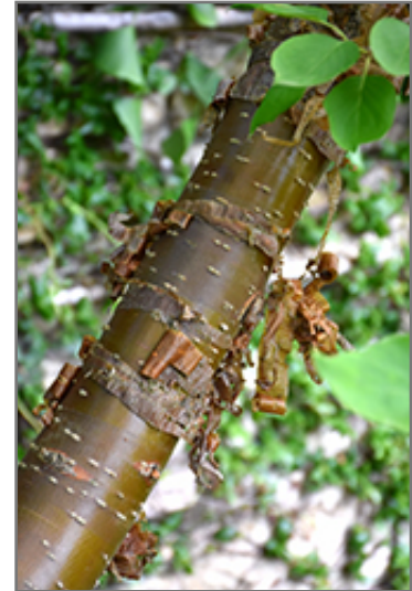
China Snow Pekin Lilac bark

China Snow Pekin Lilac is recommended for the following landscape applications;