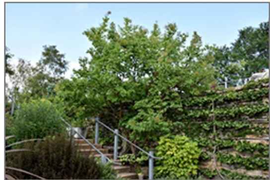
China Snow Pekin Lilac