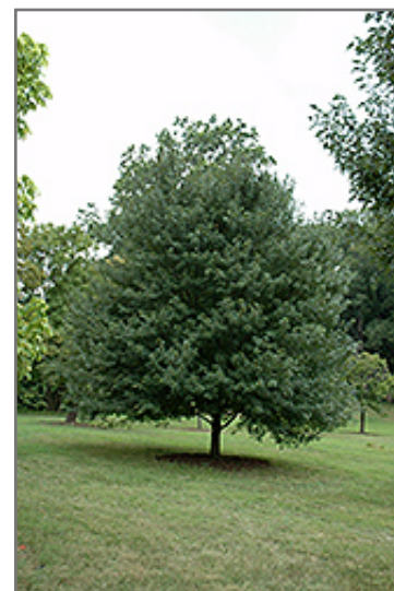
Sun Valley Red Maple