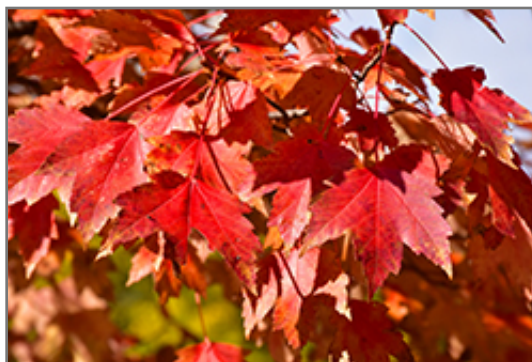
Sun Valley Red Maple in fall

This tree should only be grown in full sunlight. It is quite adaptable, preferring to grow in average to wet conditions, and will even tolerate some standing water. It is not particular as to soil type, but has a definite preference for acidic soils, and is subject to chlorosis (yellowing) of the leaves in alkaline soils. It is somewhat tolerant of urban pollution. This is a selection of a native North American species.