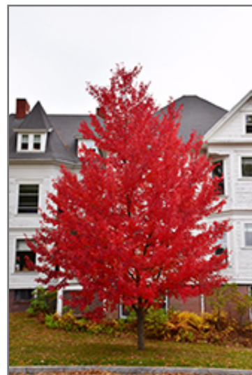
Sun Valley Red Maple in fall