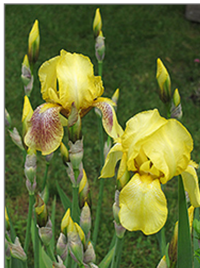
Harvest Of Memories Iris flowers