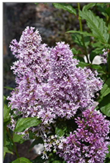
Donald Wyman Lilac flowers

Donald Wyman Lilac is recommended for the following landscape applications;