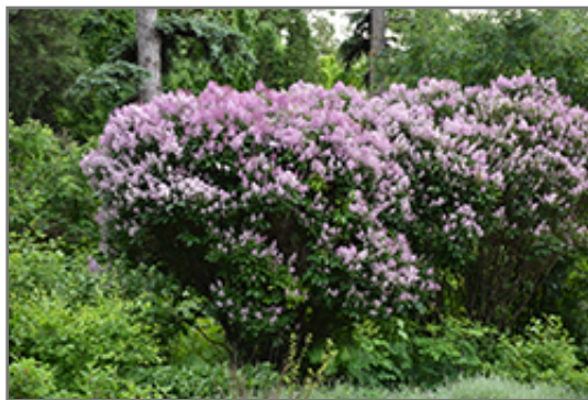
Donald Wyman Lilac in bloom