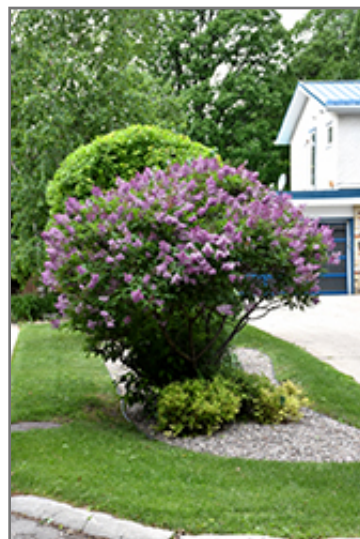
Donald Wyman Lilac in bloom

This shrub should only be grown in full sunlight. It is very adaptable to both dry and moist locations, and should do just fine under average home landscape conditions. It is not particular as to soil type or pH. It is highly tolerant of urban pollution and will even thrive in inner city environments. This particular variety is an interspecific hybrid.