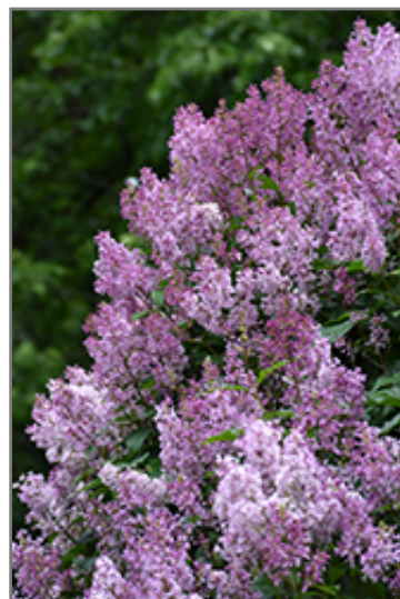
Donald Wyman Lilac flowers