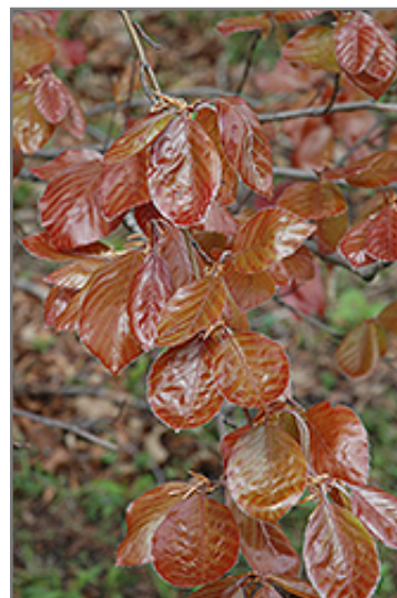
Purple Beech foliage