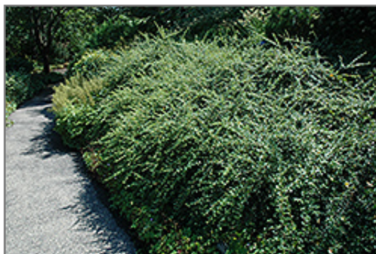
Royal Beauty Cotoneaster