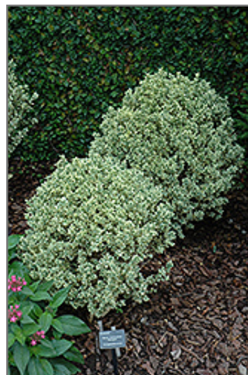
Variegated Boxwood