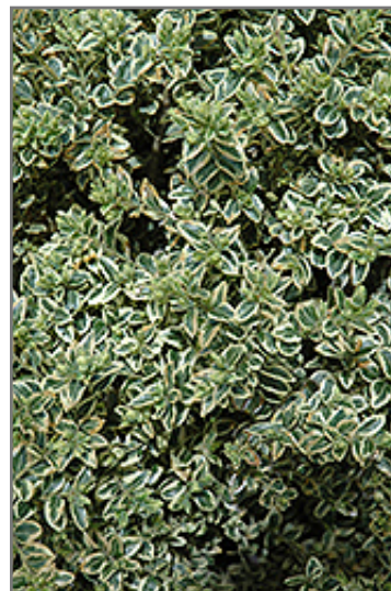
Variegated Boxwood foliage