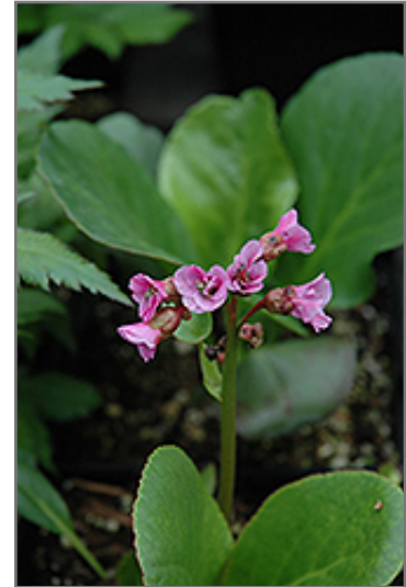
Winter Glow Bergenia flowers

Winter Glow Bergenia will grow to be about 12 inches tall at maturity, with a spread of 12 inches. Its foliage tends to remain dense right to the ground, not requiring facer plants in front. It grows at a medium rate, and under ideal conditions can be expected to live for approximately 10 years.