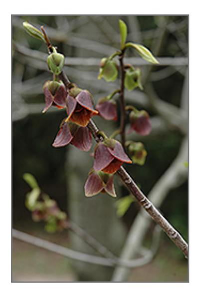
Common Paw Paw flowers