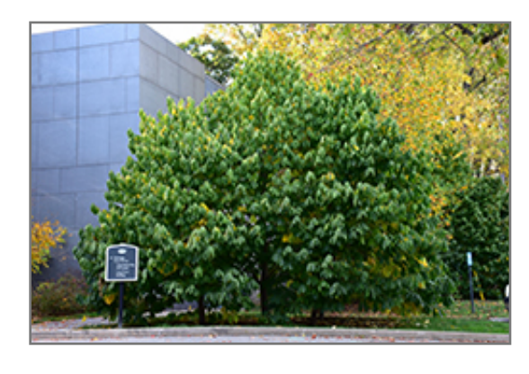
Common Paw Paw