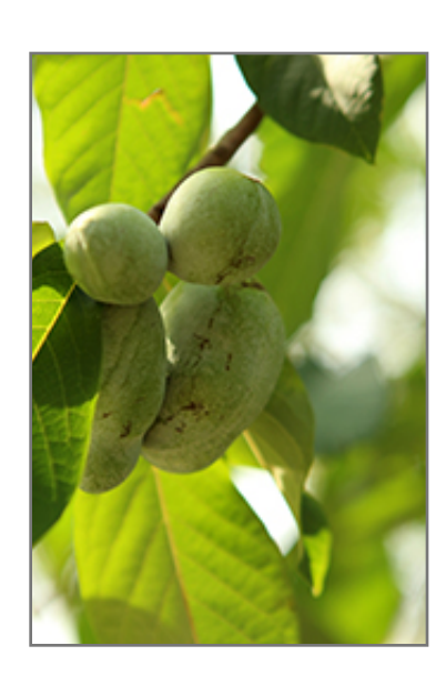
Common Paw Paw fruit

This tree can be integrated into a landscape or flower garden by creative gardeners, but is usually grown in a designated edibles garden. It does best in full sun to partial shade. It does best in average to evenly moist conditions, but will not tolerate standing water. It is not particular as to soil type, but has a definite preference for acidic soils. It is somewhat tolerant of urban pollution. This species is native to parts of North America.