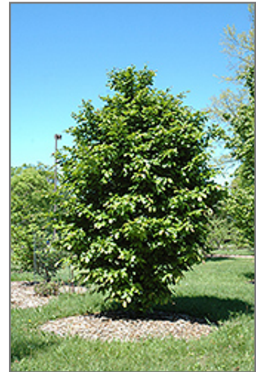
Vanessa Parrotia