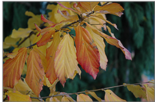
Vanessa Parrotia in fall