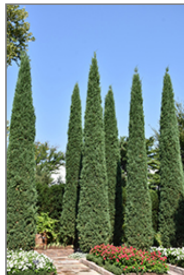
Upright, Taylor, Columnar