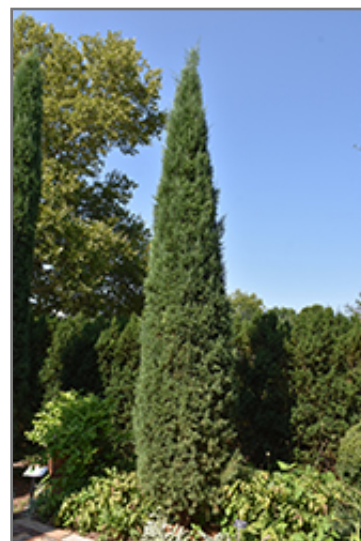
Upright, Taylor, Columnar