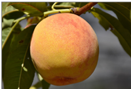
Reliance Peach fruit

Reliance Peach is clothed in stunning clusters of fragrant pink flowers along the branches in early spring, which emerge from distinctive rose flower buds before the leaves. It has dark green deciduous foliage. The narrow leaves turn yellow in fall. The fruits are showy yellow drupes with a red blush, which are carried in abundance in mid summer. The fruit can be messy if allowed to drop on the lawn or walkways, and may require occasional clean-up.