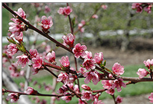
Reliance Peach flowers