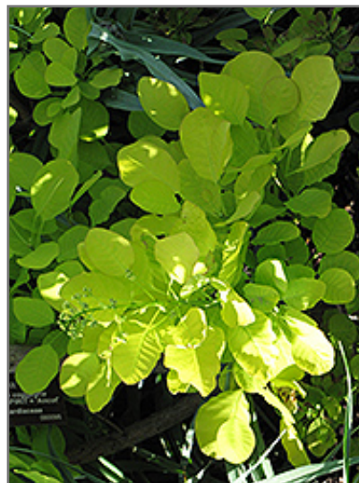
Golden Spirit Smokebush foliage