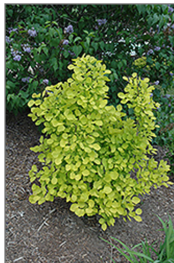
Golden Spirit Smokebush

Golden Spirit Smokebush is recommended for the following landscape applications;