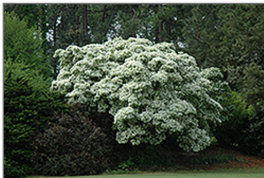
Chinese Fringetree in bloom