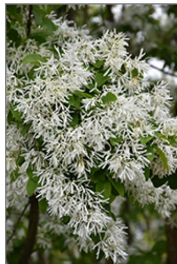
Chinese Fringetree flowers

Chinese Fringetree is recommended for the following landscape applications;