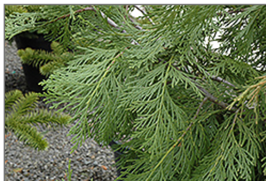
California Incense Cedar foliage