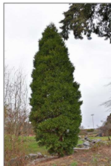
California Incense Cedar