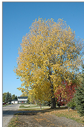
Nor'easter Poplar in fall