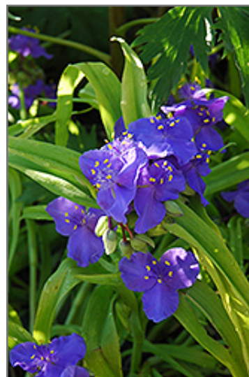
Sweet Kate Spiderwort flowers