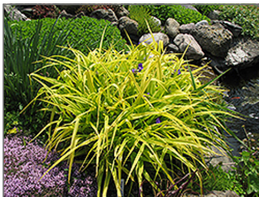
Sweet Kate Spiderwort in bloom