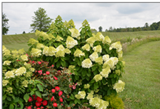
Limelight Prime Hydrangea in bloom