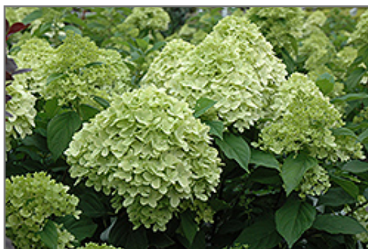
Limelight Prime Hydrangea flowers