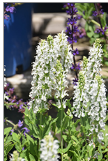
Snow Hill Sage flowers