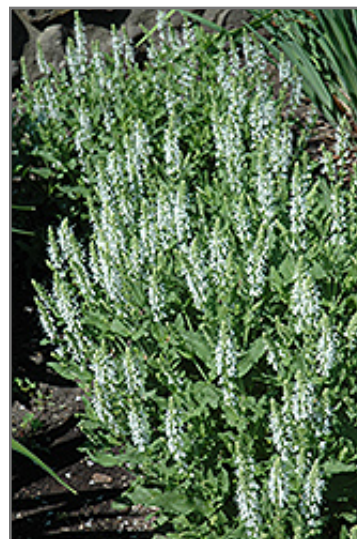
Snow Hill Sage in bloom

Snow Hill Sage is a fine choice for the garden, but it is also a good selection for planting in outdoor pots and containers. It is often used as a 'filler' in the 'spiller-thriller-filler' container combination, providing a mass of flowers against which the larger thriller plants stand out. Note that when growing plants in outdoor containers and baskets, they may require more frequent waterings than they would in the yard or garden.