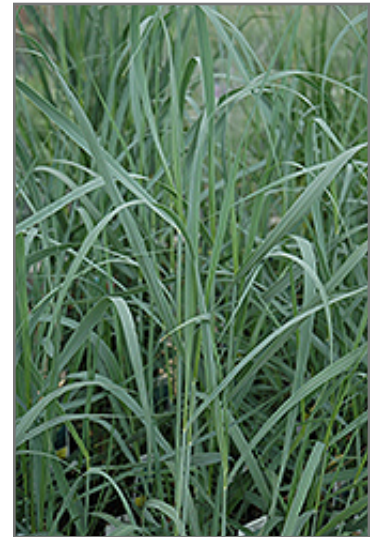
Heavy Metal Blue Switch Grass foliage