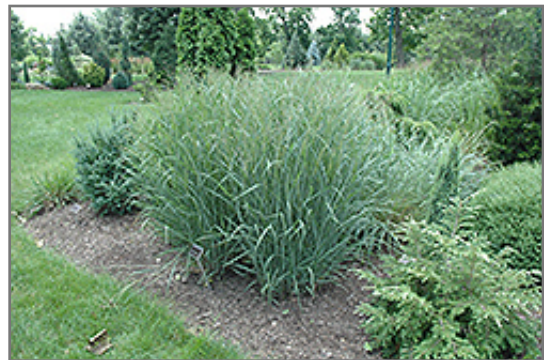
Heavy Metal Blue Switch Grass