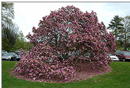
Betty Magnolia in bloom