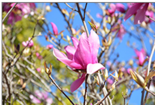
Betty Magnolia flowers