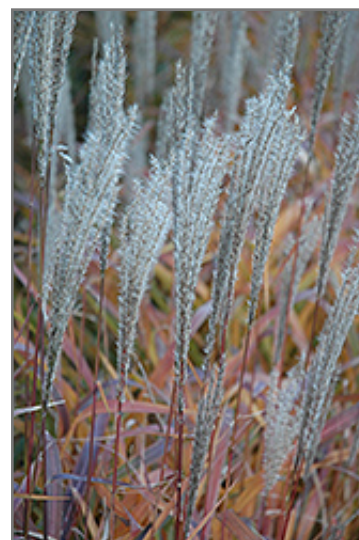
Adagio Maiden Grass Dwf. fruit