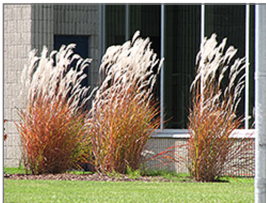
Adagio Maiden Grass Dwf. in bloom