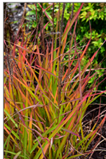
Adagio Maiden Grass Dwf. in fall

This plant does best in full sun to partial shade. It prefers to grow in average to moist conditions, and shouldn't be allowed to dry out. It is not particular as to soil type or pH. It is highly tolerant of urban pollution and will even thrive in inner city environments. This is a selected variety of a species not originally from North America. It can be propagated by division; however, as a cultivated variety, be aware that it may be subject to certain restrictions or prohibitions on propagation.