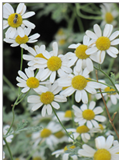
Chamomile flowers