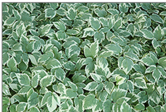
Variegated Bishop's Goutweed foliage

Variegated Bishop's Goutweed will grow to be about 12 inches tall at maturity, with a spread of 4 feet. Its foliage tends to remain dense right to the ground, not requiring facer plants in front. It grows at a fast rate, and under ideal conditions can be expected to live for approximately 25 years.