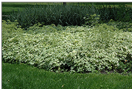
Variegated Bishop's Goutweed