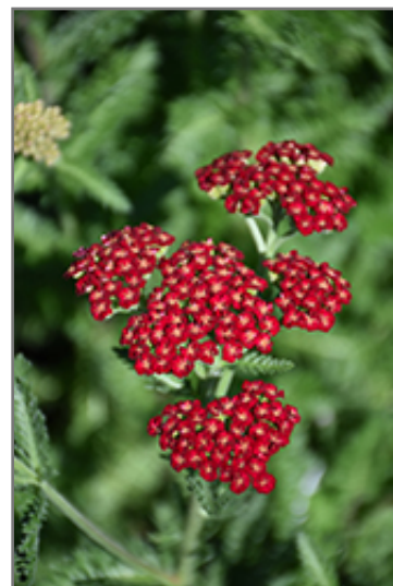
Sassy Summer Sangria Yarrow flowers