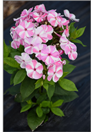
Bambini Candy Crush Dwarf Garden Phlox flowers