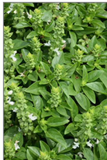
Greek Basil foliage

Greek Basil will grow to be about 10 inches tall at maturity, with a spread of 12 inches. When grown in masses or used as a bedding plant, individual plants should be spaced approximately 10 inches apart. This fast-growing annual will normally live for one full growing season, needing replacement the following year.