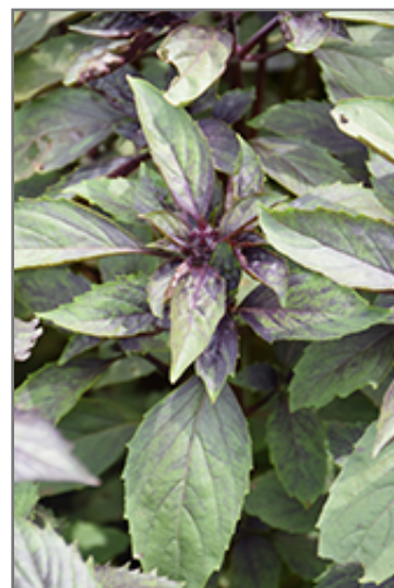
Corsican Basil foliage