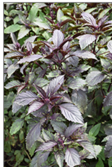
Corsican Basil foliage

Corsican Basil will grow to be about 14 inches tall at maturity, with a spread of 14 inches. When grown in masses or used as a bedding plant, individual plants should be spaced approximately 12 inches apart. This fast-growing annual will normally live for one full growing season, needing replacement the following year.