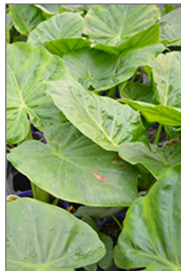
Calidora Elephant's Ear foliage