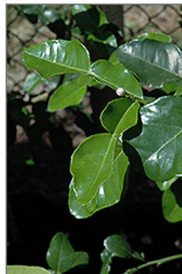
Kaffir Lime foliage