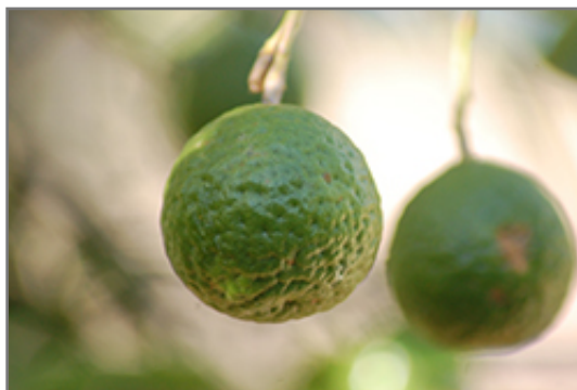
Kaffir Lime fruit

This is a multi-stemmed evergreen houseplant with an upright spreading habit of growth. This plant may benefit from an occasional pruning to look its best.