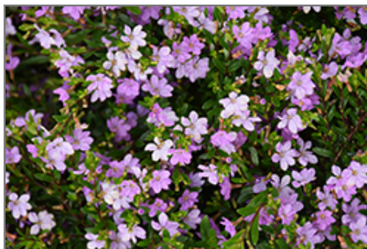
FloriGlory Sofia Mexican Heather flowers