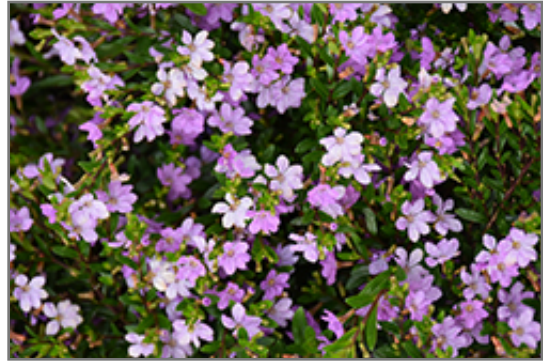
FloriGlory Sofia Mexican Heather flowers