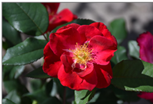
Top Gun Rose flowers