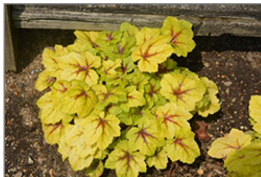
Catching Fire Foamy Bells

This is a relatively low maintenance plant, and should be cut back in late fall in preparation for winter. It is a good choice for attracting hummingbirds to your yard. It has no significant negative characteristics.