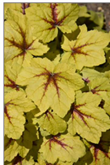
Catching Fire Foamy Bells foliage