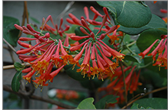
Dropmore Scarlet Trumpet Honeysuckle flowers