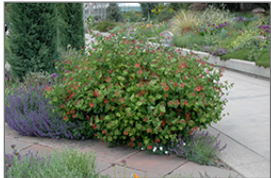
Dropmore Scarlet Trumpet Honeysuckle in bloom