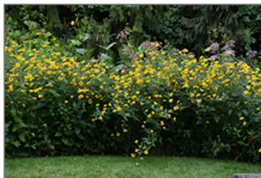
False Sunflower in bloom