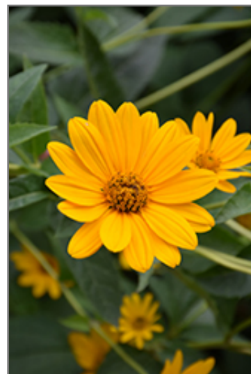
False Sunflower flowers

False Sunflower is recommended for the following landscape applications;