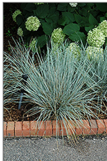
Sapphire Fountain Oat Grass