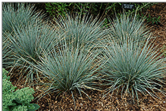
Sapphire Fountain Oat Grass