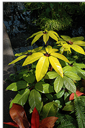
Amate Soleil Schefflera foliage

When grown indoors, Amate Soleil Schefflera can be expected to grow to be about 10 feet tall at maturity, with a spread of 5 feet. It grows at a medium rate, and under ideal conditions can be expected to live for approximately 10 years. This houseplant performs well in both bright or indirect sunlight and strong artificial light, and can therefore be situated in almost any well-lit room or location. It does best in average to evenly moist soil, but will not tolerate standing water. The surface of the soil shouldn't be allowed to dry out completely, and so you should expect to water this plant once and possibly even twice each week. Be aware that your particular watering schedule may vary depending on its location in the room, the pot size, plant size and other conditions; if in doubt, ask one of our experts in the store for advice. It is not particular as to soil type or pH; an average potting soil should work just fine. Be warned that parts of this plant are known to be toxic to humans and animals, so special care should be exercised if growing it around children and pets.