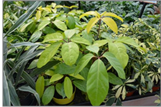
Amate Soleil Schefflera foliage

When grown indoors, Amate Soleil Schefflera can be expected to grow to be about 10 feet tall at maturity, with a spread of 5 feet. It grows at a medium rate, and under ideal conditions can be expected to live for approximately 10 years. This houseplant performs well in both bright or indirect sunlight and strong artificial light, and can therefore be situated in almost any well-lit room or location. It does best in average to evenly moist soil, but will not tolerate standing water. The surface of the soil shouldn't be allowed to dry out completely, and so you should expect to water this plant once and possibly even twice each week. Be aware that your particular watering schedule may vary depending on its location in the room, the pot size, plant size and other conditions; if in doubt, ask one of our experts in the store for advice. It is not particular as to soil type or pH; an average potting soil should work just fine. Be warned that parts of this plant are known to be toxic to humans and animals, so special care should be exercised if growing it around children and pets.