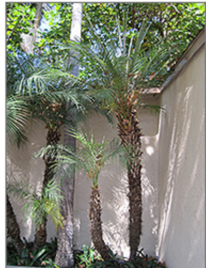
Pygmy Date Palm