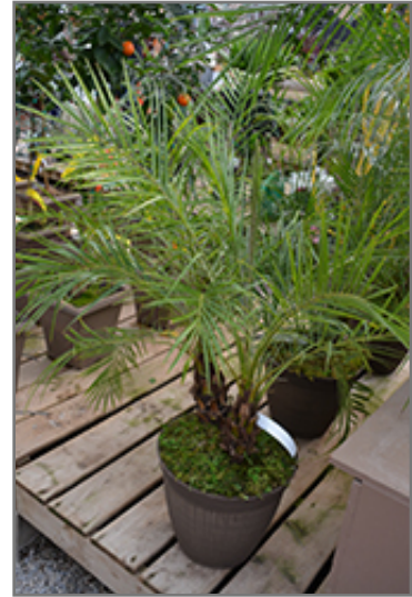
Pygmy Date Palm

This is a multi-stemmed houseplant with a towering form with a high canopy of foliage concentrated at the top of the plant. Its relatively fine texture sets it apart from other indoor plants with less refined foliage. This plant should not require much pruning, except when necessary to keep it looking its best.