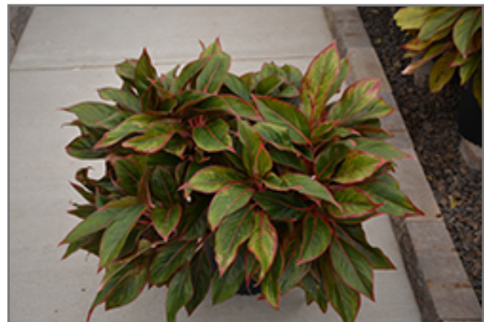
Siam Aurora Chinese Evergreen