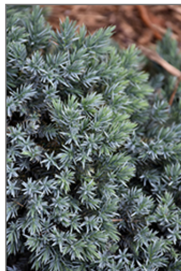
Blue Star Juniper foliage