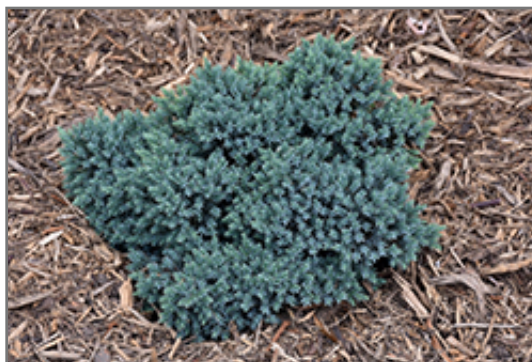
Blue Star Juniper