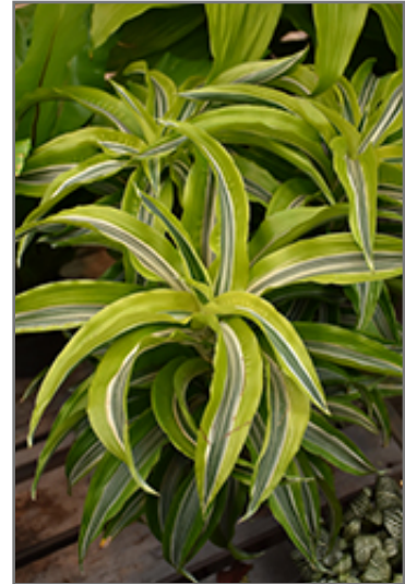
Lemon Lime Dracaena foliage

There are many factors that will affect the ultimate height, spread and overall performance of a plant when grown indoors; among them, the size of the pot it's growing in, the amount of light it receives, watering frequency, the pruning regimen and repotting schedule. Use the information described here as a guideline only; individual performance can and will vary. Please contact the store to speak with one of our experts if you are interested in further details concerning recommendations on pot size, watering, pruning, repotting, etc.