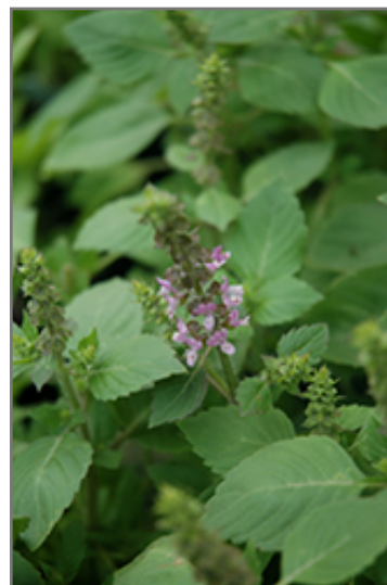
Holy Basil flowers

An aromatic, short lived perennial that is grown as a medicinal in eastern cultures; produces small purplish pink and white flowers in summer; pinch flower stems to promote leaf growth; great for mixed containers, herb gardens