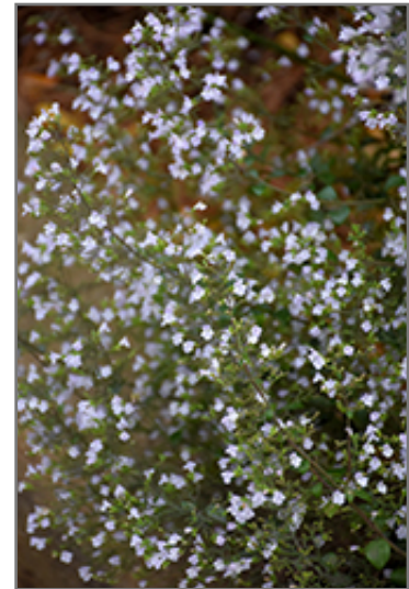
Dwarf Calamint flowers