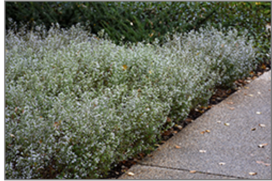
Dwarf Calamint in bloom

Dwarf Calamint is recommended for the following landscape applications;